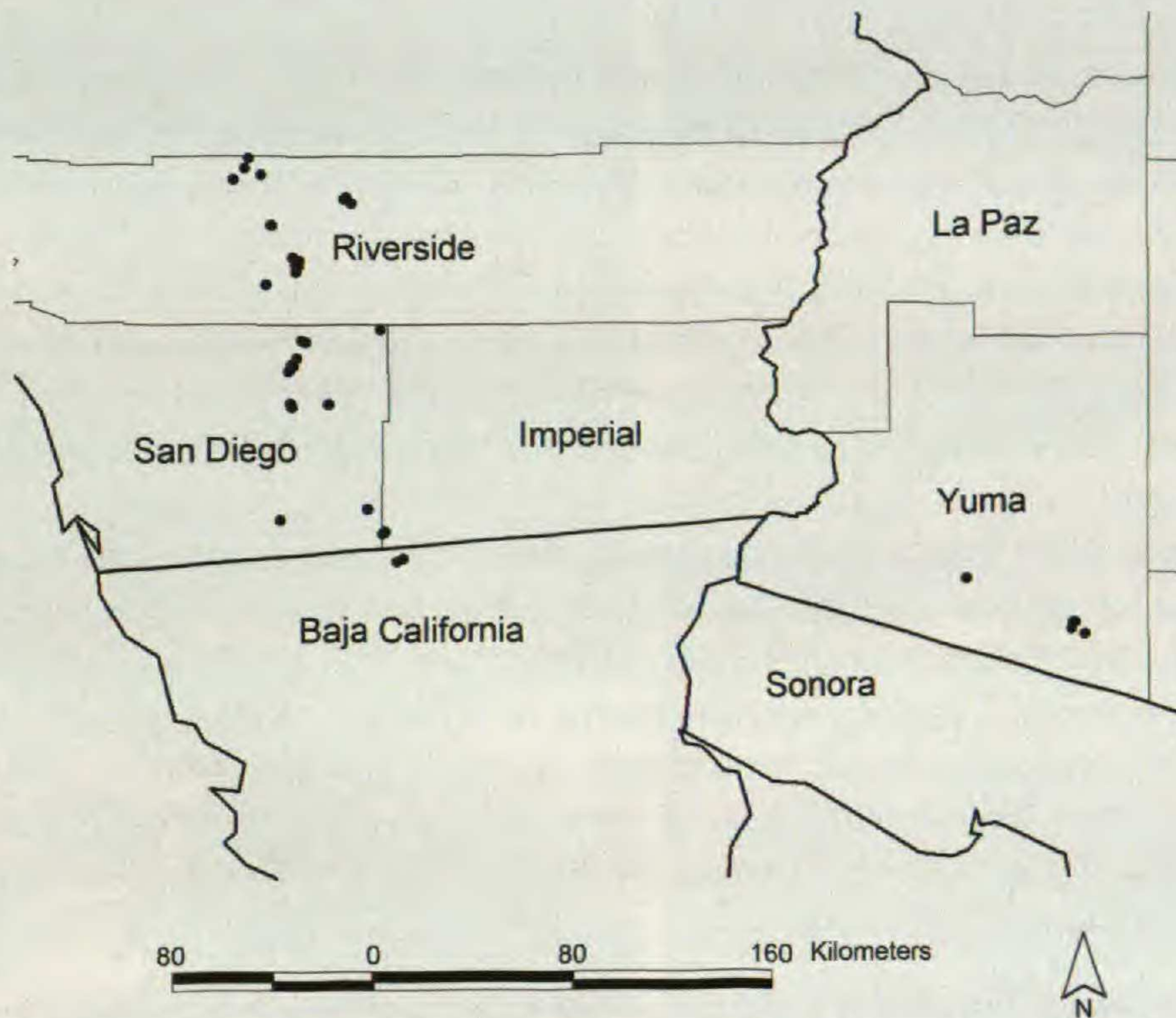
FIG. 2. Distribution of Salvia vaseyi . California and Baja California localities obtained from the Consortium of California Herbaria ( http://ucjeps.berkeley.edu/cgi-bin/get_consort.pl ) and the Southwest Environmental Information Network ( http://swbiodiversity.org/seinet/collections/index.php ); Baja California localities based on specimens cited in text and are approximate. Map by JWC.

spinescent when dry after seed maturity. The corollas, filaments, and styles are pure white, and the corolla tube 13–20 mm long (Figs. 1 & 3). Fruits have light brown nutlets 2.5–3 mm long. The Arizona plants are reproductive at least in spring and likely in fall, depending on rains (soil moisture). We found no morphological differences between Arizona and California specimens.